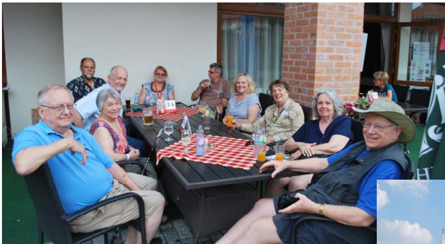
Our Pécs hosts treat us to a Sörkert or beer garden.