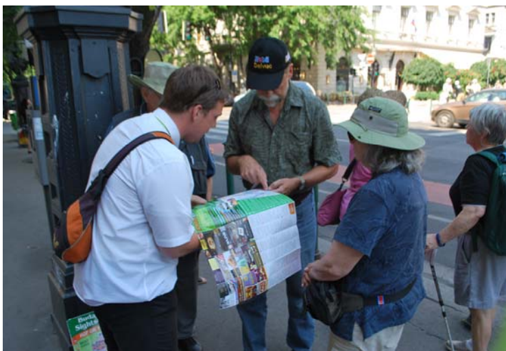
Mapping out our walking tour in Budapest.