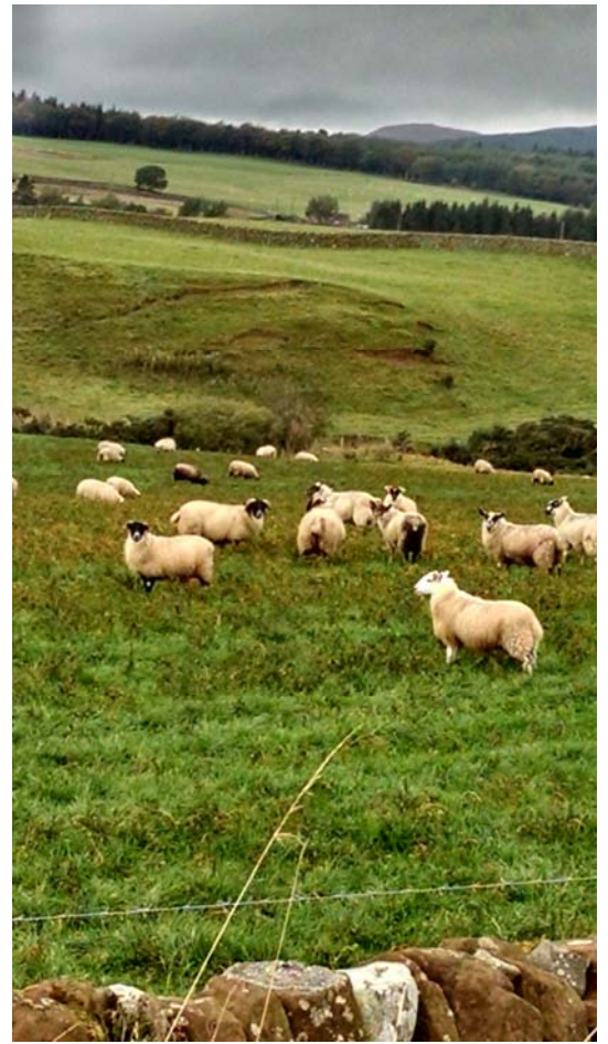
Surrender Your Cardigans!